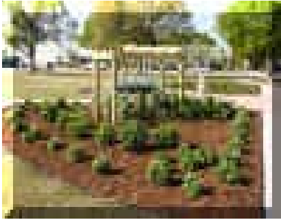
Butterfly Garden in Ocheechee on Main Street.

Email: dfculbert@ifas.ufl.edu or indianco@ufl.edu